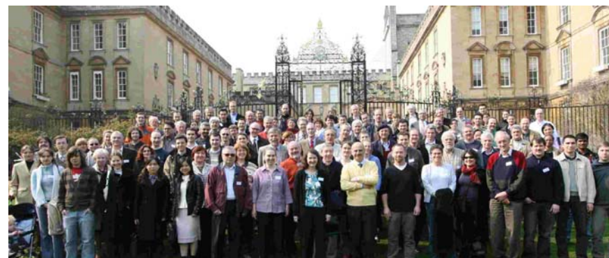
40th RSC ESR Group Conference, Oxford 2007

Full abstracts of the Keynote lectures, invited and offered short talks, posters and a photo gallery are on the website: www.esr-group.org.uk